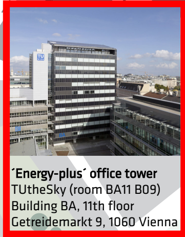
'Energy-plus' office tower TUtheSky (room BA11 B09) Building BA, 11th floor Getreidemarkt 9, 1060 Vienna